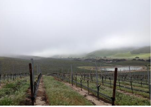
Later that morning in Paso Robles, a few vines had bud break, but mostly bud swell.