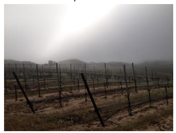
9 am in Santa Maria, the majority of the bud break already completed.