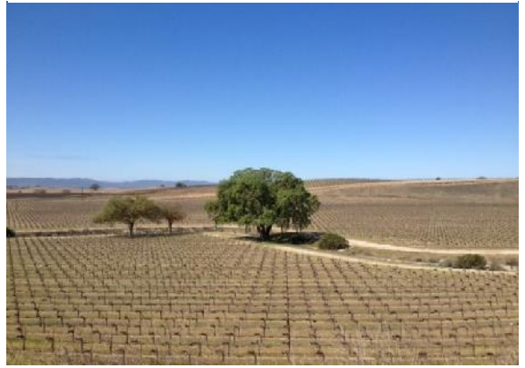
It turned out to be a beautiful spring day.